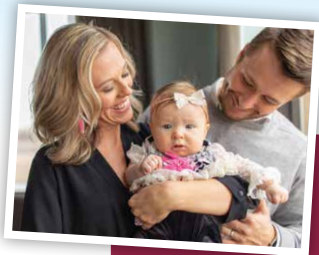
Family time with their new baby girl!

To schedule a tour of the Childbirth Center, call 806-351-7610.